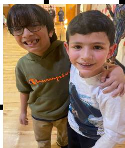
Left: Snapshots of the Primary Dance... Sooooo Much FUN!!