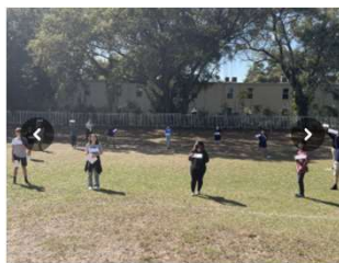
Thank you, Middle School Students for teaching us through your Living History Wax Museum.